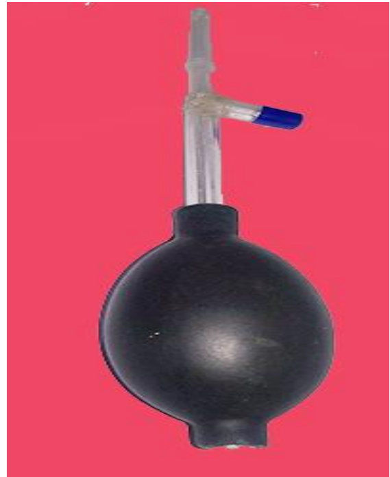
Fig 1: Nufookh (insufflation) instrument

The affected ear was cleaned by suction machine and washed with sirka (vinegar) and water (1:4) through syringing. After cleaning and drying of ear canal, the below mentioned formulation (Table1) in the form of fine powder was sprinkled in the external auditory canal through nufookh instrument (specially designed) (Figure 1) and extra powder sucked out by suction machine.