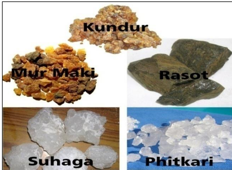
Fig 3: Ingredients of formulation used as nufookh therapy

All the ingredients were finely powdered by using mortar and pestle followed by sieving through micro aperture sieve. The fine powder then filled into specially designed air tight container to use it for treatment purpose.